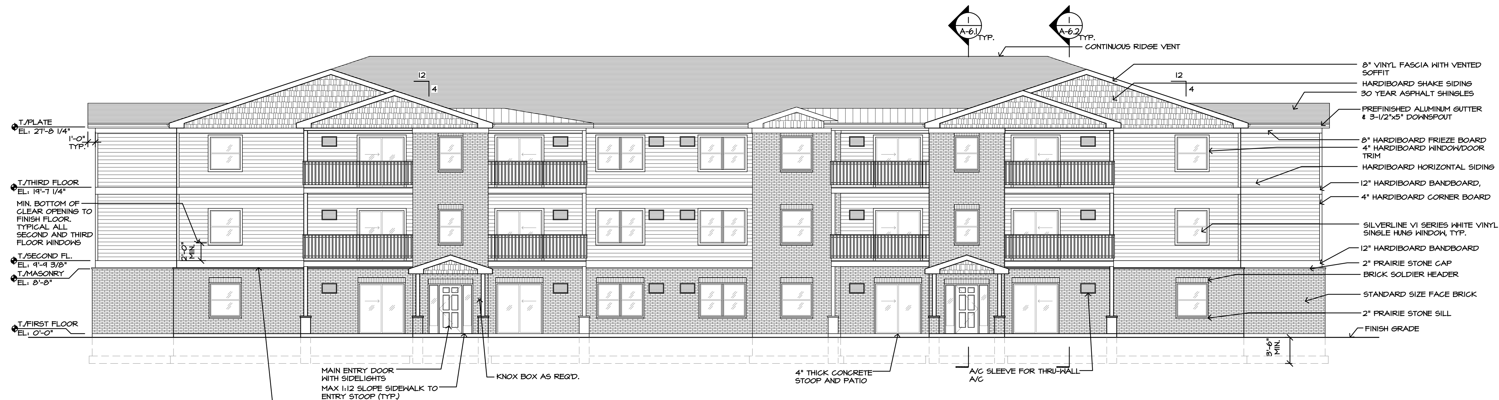
REAR ELEVATION - BUILDING A